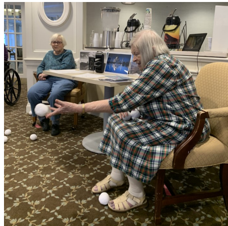
WINTERFEST FOLLIES.. SNOWBALL FUN!!